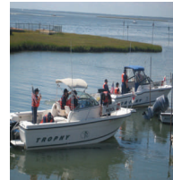
Coast Guard leaving RUMFS Boat Basin- Open House.

Forest Nature Hike, our other Ecological Evening talks, and our popular Coast Day in Cape May!