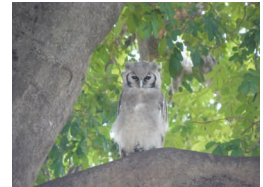
Photos: Cheeta, Giraffes, Verreaux Eagle Owl, and Stork.