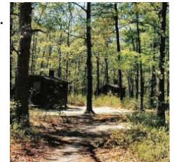
Bass River State Park http://www.forevergreennj.com/C/Camping/110/U/Bass_River_State_Park/103.aspx